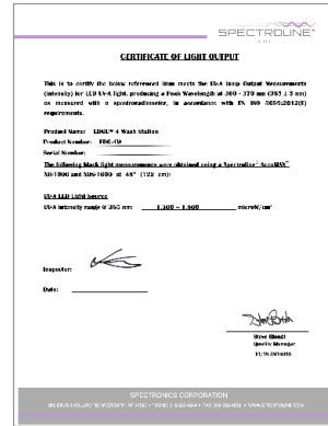
CERTIFICATE OF LIGHT OUTPUT