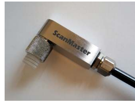
ScanMaster PA Probe

ScanMaster UT/x uses 15 MHz PA matrix transducer incorporating 61 separate elements with a 1mm pitch. It includes a built-in water path for ultimate UT performances and flexible membrane to compensate different weld indentations